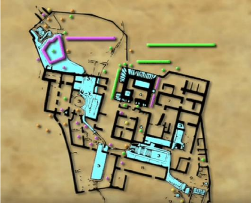
A map of the Qumran caves and possible locations of Temple treasures.

(Captured in this document in case link disappears and also to give credit to the source.)