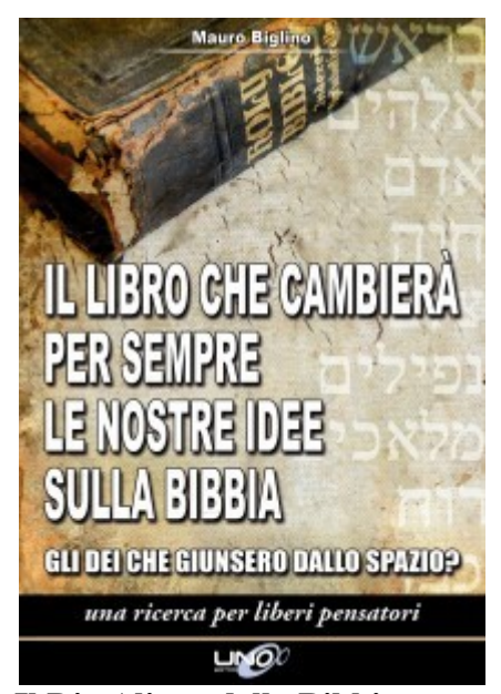
Il Dio Alieno della Bibbia